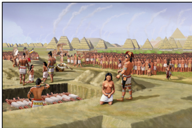
Hypothetical sacrifice rituals at Cahokia

In a new study to be published in the American Journal of Physical Anthropology in October, archaeologists from the Illinois State Archaeological Survey report their findings after conducting a strontium study of the teeth of Mound 72’s skeletons. Strontium occurs naturally in ground water and finds its way into what people eat and drink. Each region has its own particular concentrations of strontium and as it leeches into tooth enamel it provides a way of tracking an individual’s geographic history. In the case of the people interred in Cahokia’s Mound 72, the analysis revealed that the vast majority were citizens, not foreigners.