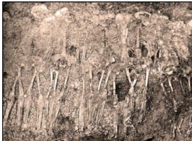
Rows of female burials in Mound 72

At 1200 AD, Cahokia (just outside of modern St. Louis) was the largest city in North America. Its 40,000 people participated in the construction of many massive earthen pyramids, called less glamorously “mounds” in archaeological literature, and some of those pyramids contained burials. Mound 72, excavated in the 1960’s, had over 270 bodies interred within, mostly young women carefully laid on their backs, shoulder to shoulder in long rows. None of the women had indications of a violent death, but another group of 39 bodies within Mound 72 did. The men and women of that group had broken limbs, projectile points lodged in bones, and a few were decapitated. Back in the 1960’s these burials were explained as enemy groups and sacrificial tributes collected from foreign territories, but new studies are telling a different story.