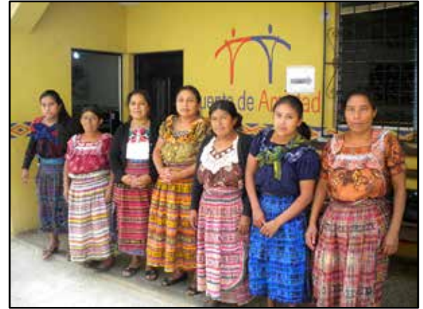
Microloan recipients at the Friendship Bridge office

will focus on the highlands of Guatemala and how the ancient Maya sacred calendar is still central to the lives of modern Maya. It's an apt subject for Friendship Bridge's goal - to assist impoverished women in Guatemala through providing microloans.