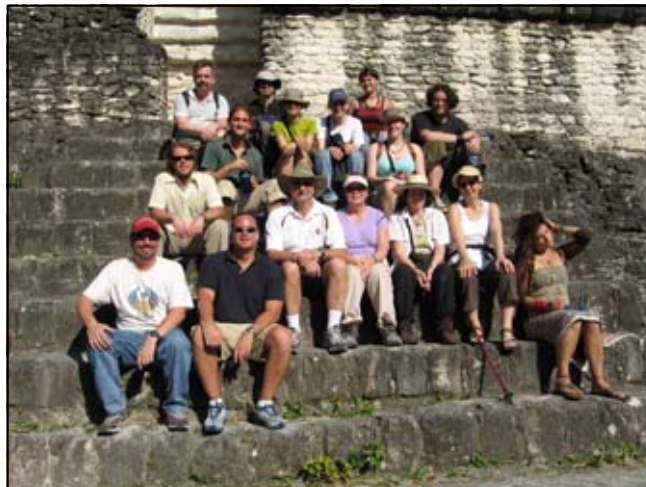
University of Pittsburgh course participants in the ruins of Uaxactun