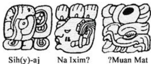
The hieroglyphic name of the Progenitor Deity

On April 19, 2006, only a few days after the Holy Week celebrations, an anniversary of mythic proportions passed by without much fanfare. The date, written as the initial series of the Tablet of the Cross 12.19.13.4.0. 8 Ahau 18 Tzek, was the birthdate of the progenitor deity of Palenque, named Muan Mat by the epigraphers. This date,