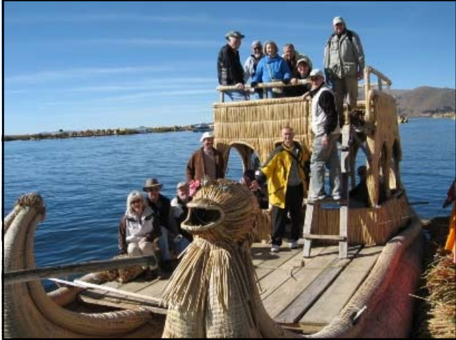
A journey around the Uros Island in a totora reed boat

in the pre-dawn dark, participants traveled silently through the fog, until a flurry of fireworks burst from the island. For the Aymara who live there, winter solstice is New Years Day! After rounding the island's northern tip and hiking up a steep trail, the group arrived at the Sacred Rock, where the creator deity Viracocha summoned the sun on the day of creation. They