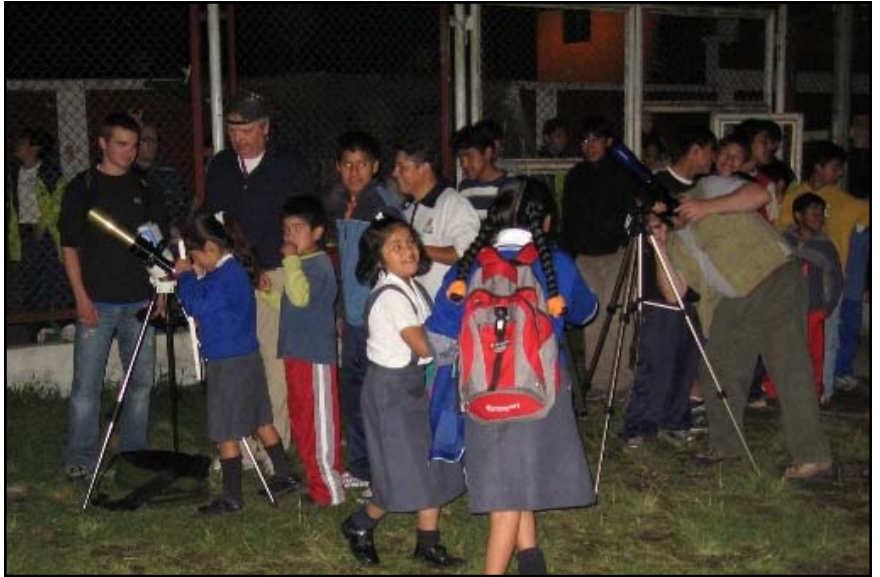
Millikin University sharing their telescopes with the community of Aguas Calientes