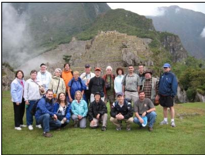
Chautauqua Peru course visiting Machu Picchu