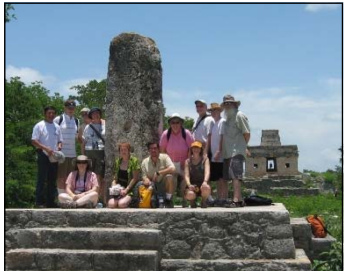
The Yucatan course at Dzibilchaltun for zenith passage

That night, hurricane Dolly swept across the Yucatan, preventing a view of Uxmal's zenith passage on the following day. Nevertheless, the rain held back long enough for a tour of the city's masterful art and urban design, as well as a discussion of the palace's orientation