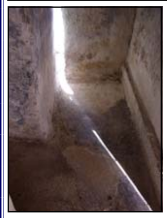
Equinox Sunrise in the Temple

Maya Exploration Center is proud to announce that our recent discoveries in Palenque's Temple of the Sun are to be published in the next edition of Archaeoastronomy: The Journal of Astronomy in Culture. Entitled, "Astronomical Observations from the Temple of the Sun," its the first in a series of articles on the role of astronomy in the history and culture of Palenque.